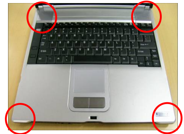
Extended corners, a key part of the Toshiba Shock Protection Design concept and provide more space for shock absorption

The second level of protection arises from rounded corners, as opposed to sharp corners, for enhanced shock absorption. Extended corners form the final level of shock protection. The protruding corners hold extra space creating a buffer between the notebook's components and casing for maximum support.