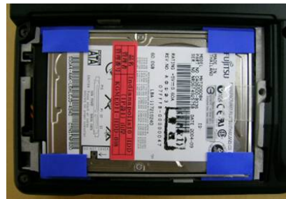
Rubber tabs encase the hard disk drive for maximum protection. This is a key part of the Toshiba Shock Protection Design,

In addition to the LCD, the hard disk drive is another vital component of the notebook, because it contains all of the data generated to date. To guard against loss of information and failure to boot (or start), in the instance of physical impact, notebooks are equipped with extra shock absorption material around all four corners of the hard disk drive for enhanced cushion and buffer against shock.