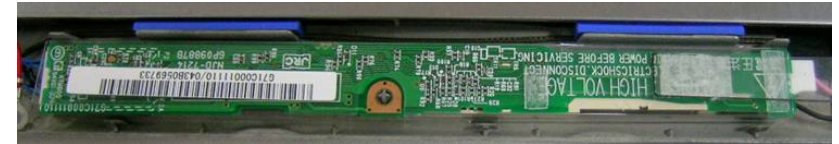
Solid rubber protection forms a protective wall around the inverter.

The inverter of any notebook is one of the most delicate components and one of the most critical as it senses low battery and ensures that the notebook does not lose power. The rubber protection forms a protective wall around the inverter to support and protect it from impact for easy, worry-free, mobile computing.